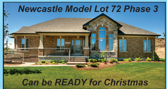
Newcastle Model Lot 72 Phase 3

Phase 5 is 80% SOLD & Phase 6 is NOW Open!