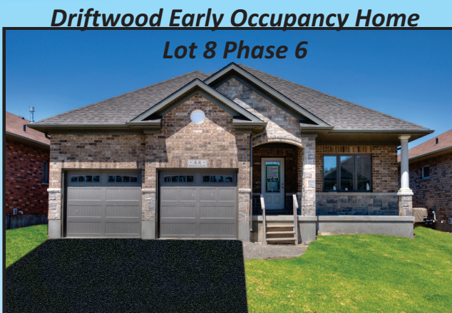
Driftwood Early Occupancy Home Lot 8 Phase 6