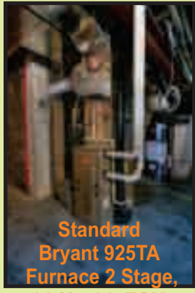
96 % with FCM