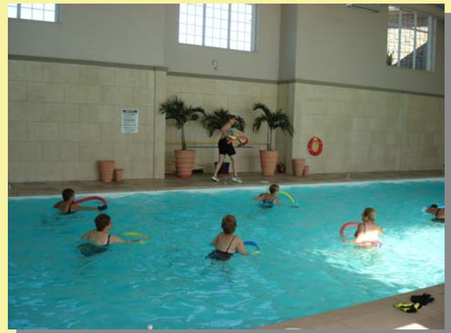
Residents meet for classes held in the New 60' Indoor Pool

A certified instructor has been hired and regular Aquafit classes are now being held in our 60' indoor pool! During the summer months we are less motivated to participate in fitness activities because of the heat, but conducting your workout in the pool is comfortable, refreshing, and healthy. Currents and eddies in the water massage the skin, promoting circulation and relaxation. Sessions run 3 weeks at a time, twice a week at two different times! With all this flexibility, it is sure to “fit” your schedule.