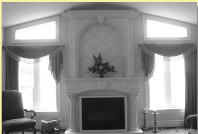
A beautiful stone fireplace is the centerpiece of the home

columns and detailing. The Master Bedroom includes a walk-out to a private deck, and the ensuite bath has been dramatically finished beyond luxurious. To inspire creative ideas for Stonecroft purchasers, the basement of this home has been finished with a custom bar, home theatre area, and an array of games items to illustrate the endless possibilities of a Stonecroft Home!