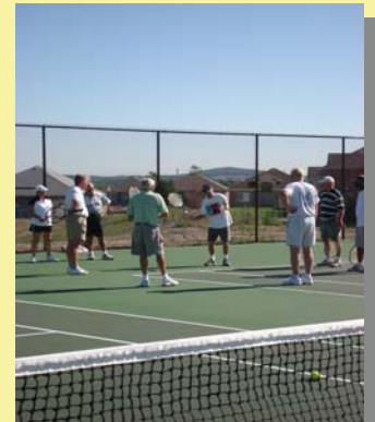
Residents meet to learn how to play tennis

Tennis courts are up and lessons have started!! Residents who are avid players have formed a club and play regularly. Always wanting more players, some residents have reserved court times for those interested in lessons. Times reserved for these lessons do not coincide with the many other activities such as badminton, table tennis and indoor shuffleboard in the Great Hall, so there is no need to “pick and choose” your activity! You can join them all!