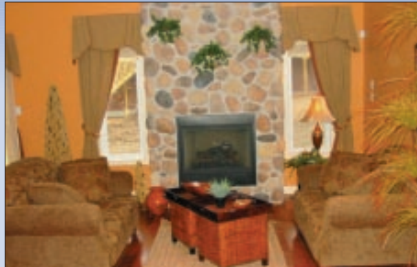
The Montana II Model Home

The Montana II model is now complete and open for viewing. The Montana II is our fourth model, and takes on a ranch style flavour. The grand opening of this model took place during our Strawberry Festival in June. We enjoyed a great response from all those who viewed it. The open-concept design, trendy decorating, spacious master bedroom and an ensuite will have you relaxing in seconds!