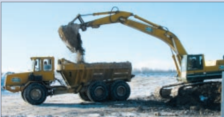
Phase 2 construction underway in bitter cool January!

water mains. The goal is to have the road base constructed by April 15th 2004 and basecoat asphalt on in early May.